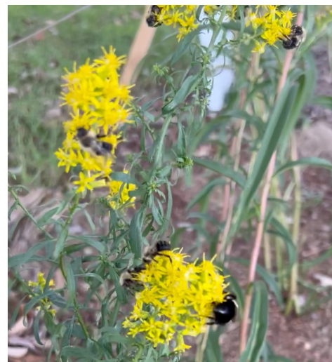
Native bumble bees enjoying our native Bombus impatiens .